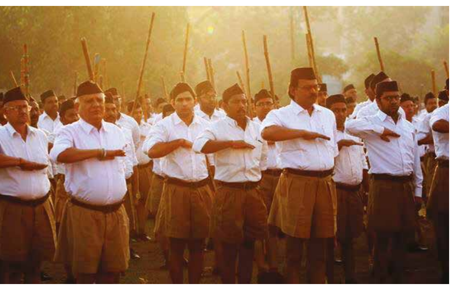
Hindu group Rashtriya Swayamsevak Sangh (RSS).

The BJP is the political front of the RSS and most of the BJP leaders, including the Prime Minister Narendra Modi, have been members of